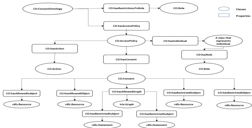
Figure 1: The consent ontology used in the access policy framework