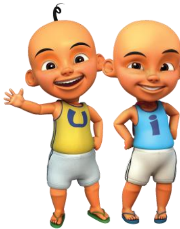
Figure 4. The exaggeration of the main characters of Upin and Ipin

Another interesting example is the popular children cartoon series Upin dan Ipin [20], in which such principles were applied to the Upin's and Ipin's heads, which are the main characters of the series (see Figure 4).