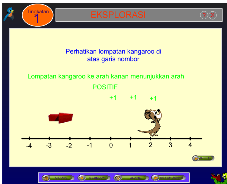
Figure 9. An animation of a positive movement of the kangaroo character