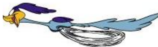
Figure 2. The exaggerated animation of squash and stretch

The second way to apply the principle of exaggeration in animation is through squash and stretch. In particular, squash and stretch refers to the impact of force on a moving object. A case in point was the movements of Road Runner in the animated cartoon of Rabid Rider [18], which used exaggerated squash and stretch animation, as shown in Figure 2. The principle of exaggeration in Road Runner animations is used by displaying a long neck and leg behind in the back when Road Runner begins to accelerate which shows its speed and the effect of gravity strength.