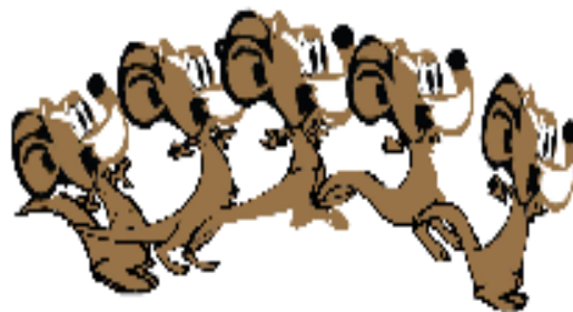
Figure 5. Combination of two method of animation exaggeration

For this study, a combination of two methods of animation exaggeration was used to develop the multimedia learning application based on the requirements of the research, as shown in Figure 5. The two methods of applying the principle of exaggeration that used in the study are squash and stretch and character design.