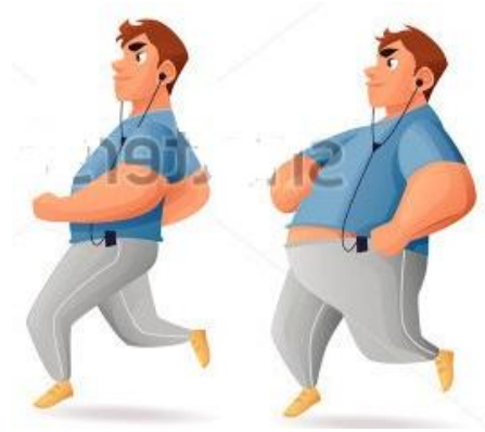
Figure 3. The exaggerated animation of character design

Another interesting example is the popular children cartoon series Upin dan Ipin [20], in which such principles were applied to the Upin's and Ipin's heads, which are the main characters of the series (see Figure 4).