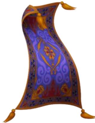
Figure 1. The exaggerated animation of body language

One of the ways to apply the principle of exaggeration in animation is in the construction of the body language. For example if one character has an overweight, the character can be generated using a body language as hard to move. In other example in the Aladdin film [17], emotion of the Magic Carpet is shown through the body language because carpet has no face. The principle of exaggeration is used on the body language to show sad and happy emotional character of the Magic Carpet. Figure 1 shows the happy emotion of the Magic Carpet.