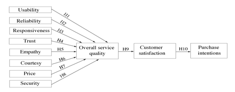
Figure1. Proposed Model of this study

Usability dimension is defined as how far the system is simple to use and structured properly [39]. The service is easy to use and easy to search for desired products. The process of Shopping on Facebook is clear, understandable and user friendly.