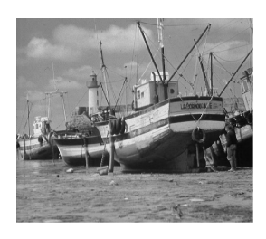
Fig.2 Original images used for analysis (a) Cameraman (b) Boats