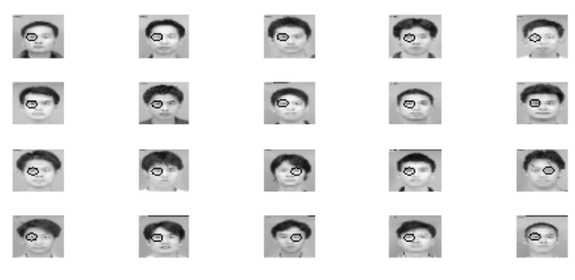
Fig. 3 Left Eye Detection

In this section we represent the experimental results of eye template matching using cross correlation techniques. The proposed method has been tested by images from chufs face database [19]. The experimental results show that, the template matching using the normalized cross correlation method is accurate and fast. The graph in fig. 5 shows the time required to detect right eye is more compare to the left eye. We found that the average time required to detect left eye on the face image is 1.549 seconds and for right eye 1.950 seconds for 20 faces. The time for right eye detection is more due to the position of the eye on the face.