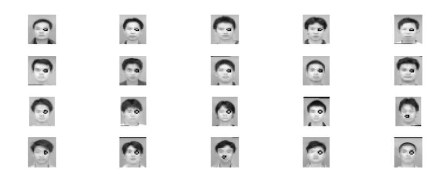
Fig. 4 Right Eye Detection