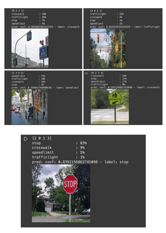
Figure 4. Examples of analysis result

The result in Figure 4 shows that the network speed is the main factor which affects the average connection delay.