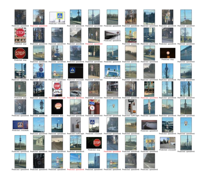
Figure 3. Sample images

After the algorithm has learned using the training data, we input testing images to the model in order to evaluate the result. The predicted results are plotted using matplotlib, shown in Figure 3. If a "Predicted: " result is different from the label in the dataset, the text is printed in red. Predictions labeled using green are otherwise correct.