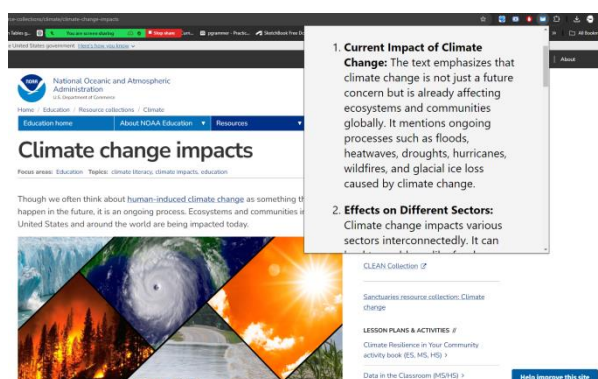
Figure 4. Screenshot of program on page

The third component is the Chrome Extension as figure 4 shows the page the end-users see. Chrome Extensions are easy to run for the end-user on the webpage and fit the need of summarizing articles online well, which helps with the accessibility of this application. When the icon is clicked, a popup window will display the ChatGPT summary of the web page. The extension uses HTML, CSS, and Javascript, which is used to send a request to the Python Flask server [14].