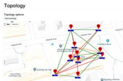
Fig 6.3 Network Scenario in OpenWSN

The Open Visualizer along with Open Sim consists of core modules and different types of user interfaces as follows[27]:Graphical user interface (GUI),command-line interface (CLI) and web interface.Python Language is used for interaction.It includes python modules for operation such as :open Visualizer Gui, moteProbe etc.To get started with the visualizer, point your browser to the URL: http://localhost:8080 . Simulation is event based so it is more realistic to analyze any scenario.RPL and CoAP protocols are analyzed with one very simple application.A small network is considered in the OpenWSN simulator,which includes 10 sender nodes and 1 sink node as a root. The network is shown in Fig 6.3.