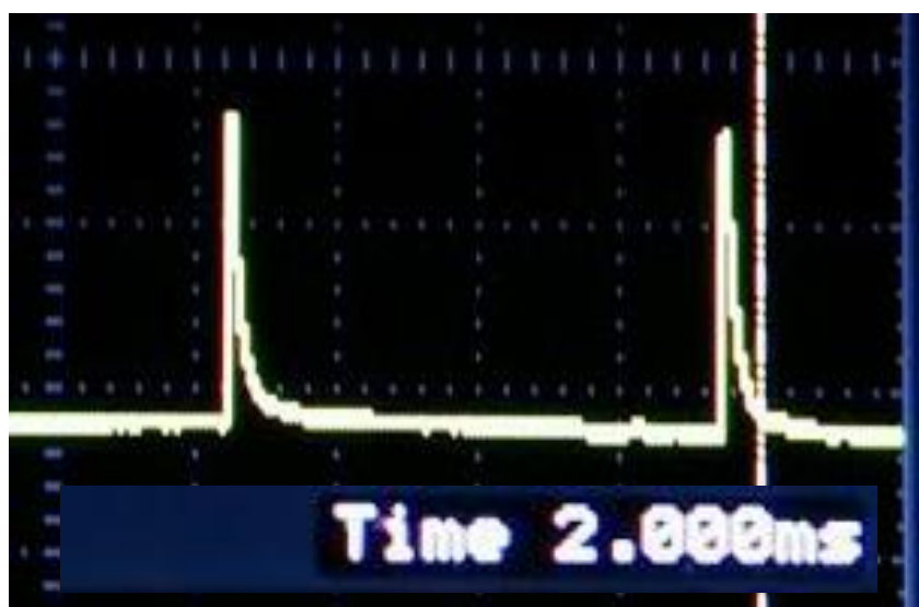
Figure 1: The pulse signals emitted by the automatic door in order to detect the movement.

The doors are opened by the motor which is controlled when the sensor detects the movement, like as the person and dynamic objects, and so on. There are about three kinds of sensors: 1) near-infrared spectroscopy, 2) far-infrared spectroscopy, and 3) microwave. In Japan, most of automatic door sensor are near-infrared spectroscopy. The near-infrared reflection sensor uses a near-infrared reflection detection method in which near-infrared rays are radiated in a certain range and the change in the reflection of the light is detected (shown in Figure. 1). So, most of Japanese automatic doors always emits the infrared rays. Then, we can detect the automatic door by detecting the infrared rays.