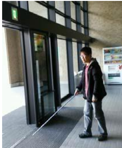
Figure 3: The examinee walks into the automatic door using the proposed white cane without his visible and hearing.