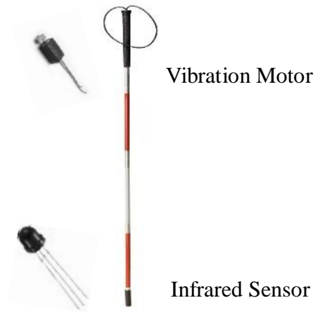
Figure 2: The proposed device with the vibration motor and the infrared sensor which detects the automatic door and tell its existence to the user.

first (shown in Figure 2). Then, by setting a vibration motor to the grip of the white cane, it is possible to notify the user of the existence of the automatic door by tactile sensation.