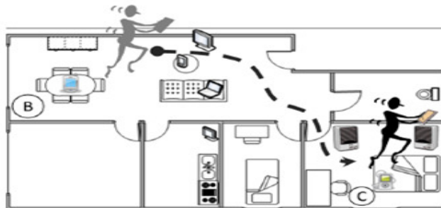
Figure 1. User moving from zone B to zone C

Our vision is based on a user-centric approach; meaning that, all devices and gadgets belong to the same owner and, as the user is moving from one zone to another, is the user's main device the one that will appear or disappear in the ambiances defined in the system, as a result, available devices and their resources can appear or disappear seamlessly as shown in Figure 1.