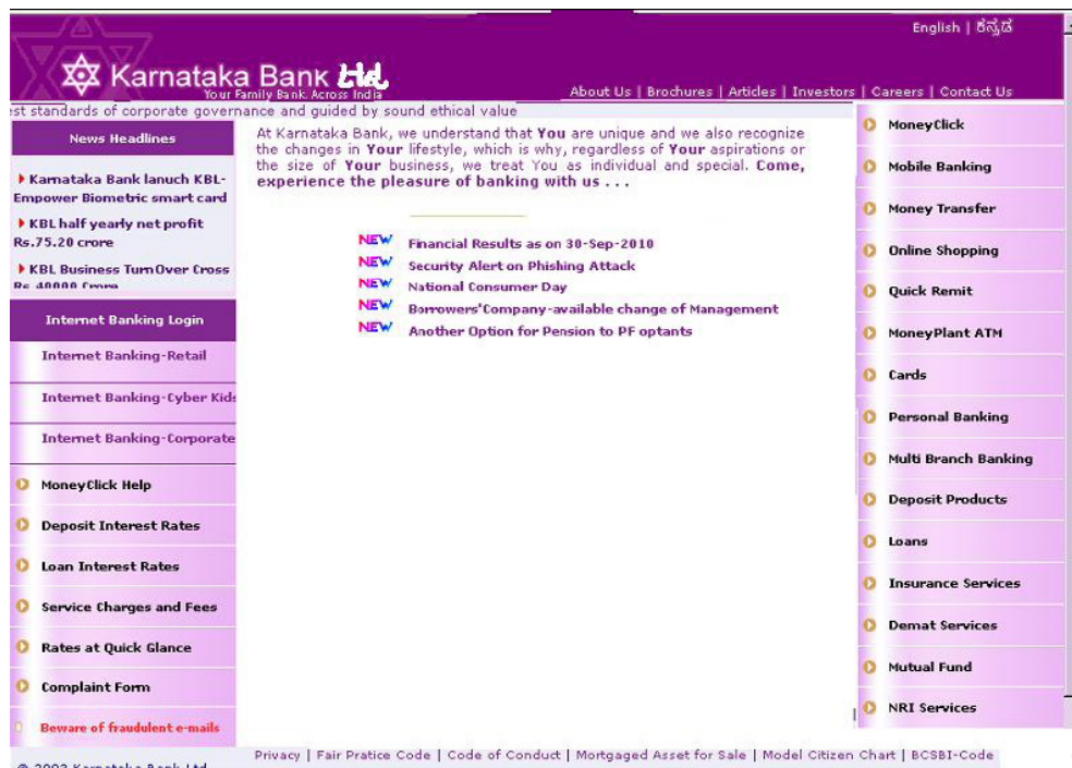
Fig. 3. The result after extracting the sample web page

The result of content extraction is shown in Fig. 3. The size of original source page file is 92.4 k Bytes, which contains many pictures and advertising links. There is only less than 1 k Bytes after content extraction. This extraction is extremely necessary for enterprises and organizations to obtain information and knowledge from the Internet which contains a huge treasure of knowledge.