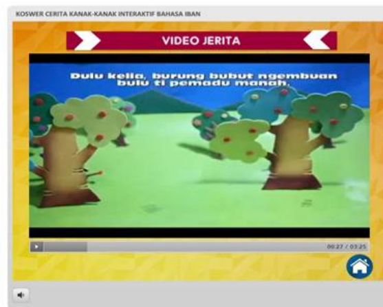
Figure 6: Video page.

session was carried out to add the sound elements into the story. After the completion of these two sessions, the editing session was performed using Power Director. Using this editing tool, images were combined into a video for a particular scene. Once all the required scenes were edited, they were then combined into a video together with the background music. In addition, subtitles were also added to help viewers understand the conversations or to help teachers read the dialogues of the story with their students. Finally, the publishing process was carried out after there were no more amendments to be made to the story. Figure 5 shows one of the video page.