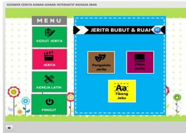
Figure 5: The story page of the IDST

The reinforcement page of IDST has link to a questions bank that helps measure users' understanding of the story learned. Clicking this link will direct users to the interface of the questions bank.