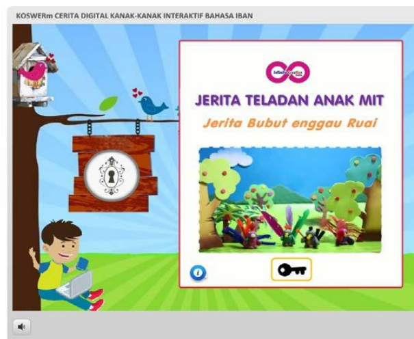
Figure 2: The main page of the IDST

Figure 2 shows the main page of the learning application showing the title and graphical characters of the story. Users need to unlock this page before logging in on the application. To unlock the application, users are required to select and drag the unlock key to a key hole. The purpose of the unlocking technique is to add an extra interactive element to the application such that users, namely children, will be exposure to new experience that is fun and interesting. The use of suitable colours depicting a lush field against the vast open skies and a child passionately reading a book invokes a feeling of happiness. In addition, the use of suitable background music makes users feel content and relaxed. Moreover, a button with audio guides users to navigate with ease. Figure 2 shows the main page of the IDST.