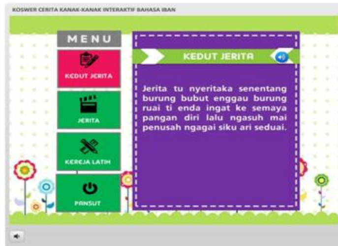
Figure 4: The synopsis page of the IDST

Figure 4 shows the page highlighting the synopsis of the story, with an audio “teaser”, when users press the “Kedut Jerita” button.