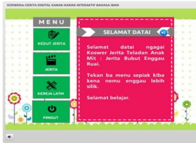
Figure 3: The menu interface of the IDST

The combination of attractive colours helps attract users' attention and make them enthusiastic when using the application. The interface was designed to be simple and organized, with selection menu located at its left side (see Figure 3). Furthermore, each menu has its own transition to further improve the application's ease of use. Intuitively, users will be able to use the application using such a user-friendly interface design. Figure 2 shows the menu interface of the IDST.