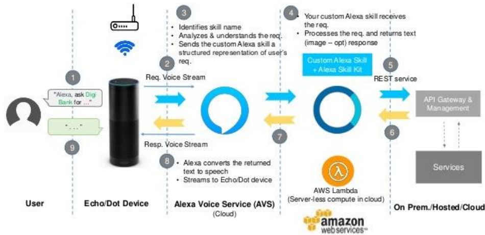
Figure 2. Amazon Alexa Custom Skill – Reference Architecture

An Amazon Alexa custom skill is shown in Figure 2. Customer may ask a question or give a command; Alexa identifies the skill's name, analyses and understands the user's request, then sends the service a structured representation of the user's request; service processes the request and returns a text; Alexa converts the returned text to speech and streams it to Echo; Customer hear the response from Alexa's voice.