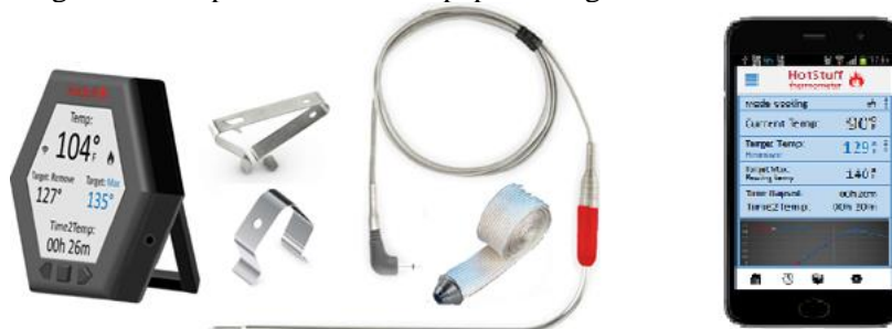
Figure 3. An Intelligent Food Thermometer and its APP

As an important component of smart cooking, an intelligent food thermometer and its mobile application is designed and implemented in this paper as Figure 3.