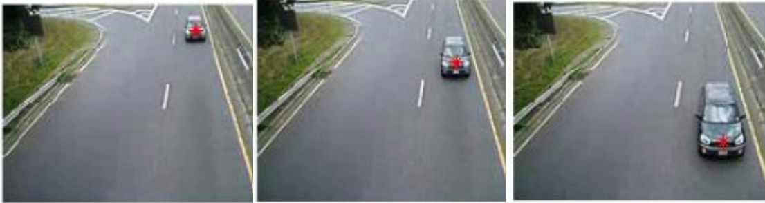
Figure 1. Multi car tracking