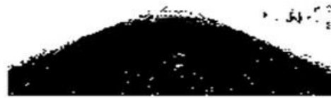
Figure 2b output image of the autonomous vehicle

The evaluation schemes used to test the output image of the system with filtering algorithm are expressed in equation (24)–(29). These evaluation schemes illustrate the measurable rate of how successful the optimized road recognition system has improved the navigation of the autonomous vehicles.